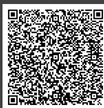
Ladies link to RSVP

To reserve a spot use the QR codes below! If you have any questions, please reach out to Abby or Joe!