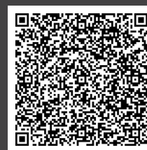
Mens link to RSVP